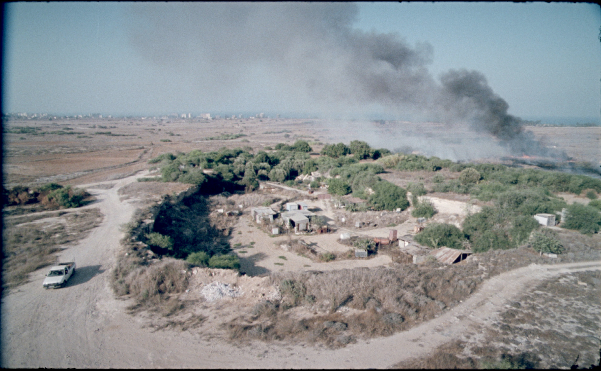
Rosa Barba, Inside the Outset: Evoking a Space of Passage , 2021, 16mm film transferred to digital and 8k film, sound, 31:15 min, film still © Rosa Barba

For the first time in France, the public will be able to experience one of the works called Inside the Outset: Evoking a Space of Passage within a device that reflects the project itself. Begun in 2014, Inside the Outset consists of two components: a film and a permanent outdoor film installation located in Cyprus. For the construction of the latter, the artist focused on integrating the cinema into a natural environment, avoiding the use of materials alien to the landscape, in collaboration with local architects, and supervised by the architect Maya Shopova. The metal structure of the projection screen is the only visible part above ground level. The seats are integrated into the ground. This architectural technique will enable the theatre to last in the environment for the next ten years without any specific restoration, enabling it to deteriorate gradually, depending on the regional weather conditions. Rosa Barba envisions the setting of this installation as a meeting point for members of all the island's communities. Her intention is to highlight the ability of art to create spaces for interaction and coexistence. This proposal for the CCCOD will focus on the same aim.