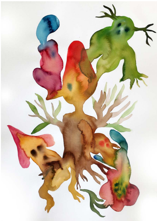
Pinocchio Star , 2018, 76,5 x 57 cm, aquarelle sur papier, courtesy de l'artiste

The exhibition will be presenting recently completed and previously unseen works, combining imaginary characters and self-portraits.