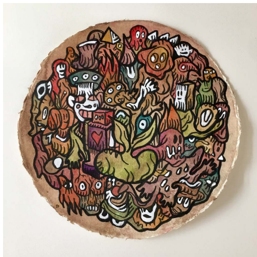
Magic Bean , feutre et aquarelle sur papier, 20 cm de diamètre, 2019, courtesy de l'artiste

For this new solo exhibition at the CCC OD, Verschaere deploys a symbolic geographical map on which works produced in recent years dialogue with previously unseen creations. He extends his world to fill the transparent galleries visible from outside the CCC OD.