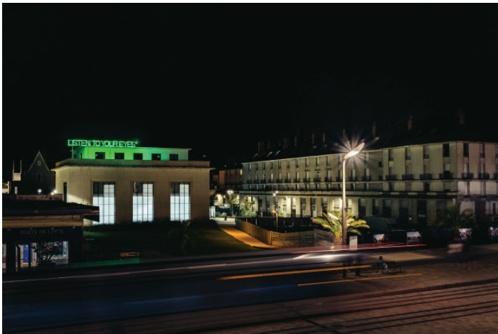
Maurizio Nannucci, Listen to your eyes , installed at the ccc od, Tours, 2018

Listen to Your Eyes , crowning the façade of the ccc od, is reminiscent of an advertising sign. This paradoxical instruction is unsettling and questions. The viewer/reader faces a word association that is seemingly impossible to resolve in the first instance. Through such linguistic feats, matching the scale of the architecture and the urban landscape, the artist Maurizio Nannucci succeeds in creating new mental spaces and a fresh perception of the surroundings of the spectators.