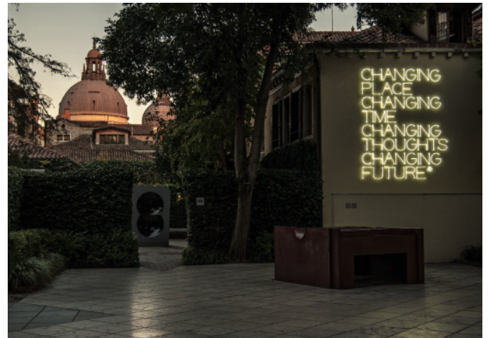
Changing place, 2003 Museo Guggenheim, Venezia