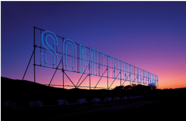
Something happened , 2009 Villa Medicea La Magia, Quarrata (Pistoia), Italie