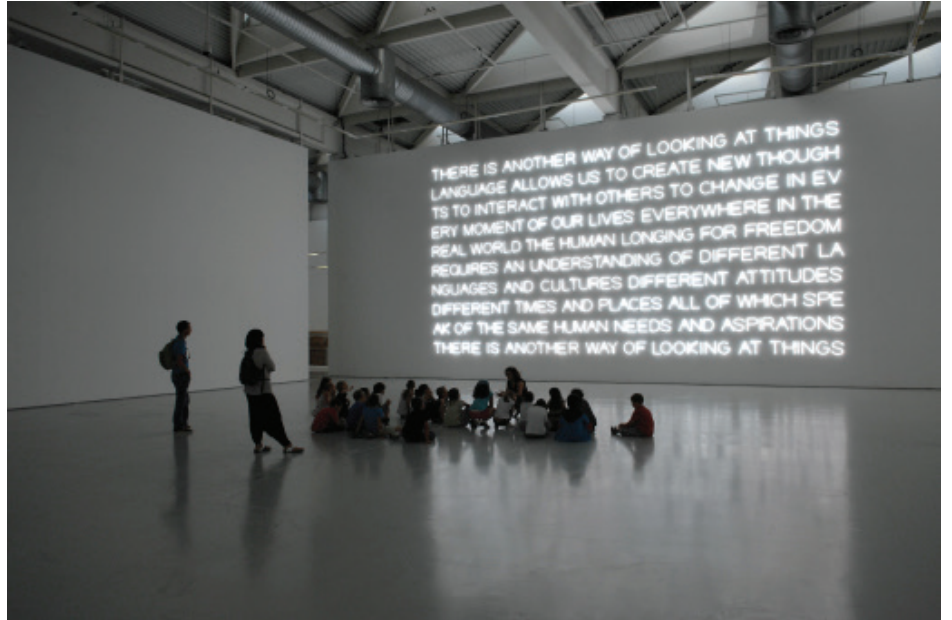
There is another way of looking, 2009 Musée de Saint-Etienne