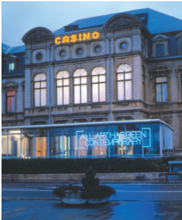
All art has been contemporary, 2000 Casino Luxembourg, Luxembourg