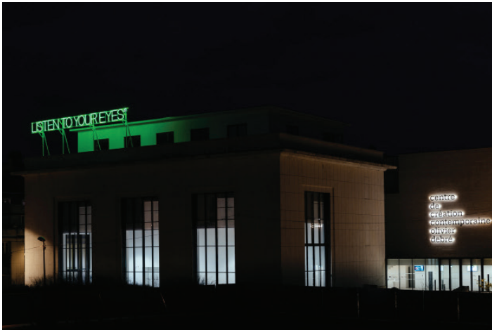
Maurizio Nannucci, Listen to your eyes , installed at the ccc od, Tours, 2018