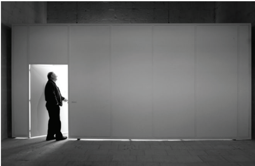
The Air-Conditioning show 1966-1967

In this reflection on painting, the artists replace the latter by a mirror and invite viewers to identify the mirror, not through its usual function, but like an 'objet d'art' in the museum setting.