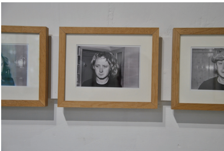
Art & Language in disguise 1980

By using the codes of propaganda posters, by distorting these codes, and above all by constructing this series of posters like a sequence of images, as if these images were very simply extracts from a film or an opera. In turn we see revolution, battle, success, obligation, mockery, prevention, joy and also failure. Like the 7 deadly sins, these posters deal with the foundations on which our society is built and above all what makes a success story from the codes of the tragedy within it. The message for the Art-Language magazine is subliminal, the logo is not even customised, and yet only one of these posters is dedicated to advertising for one of these magazines.