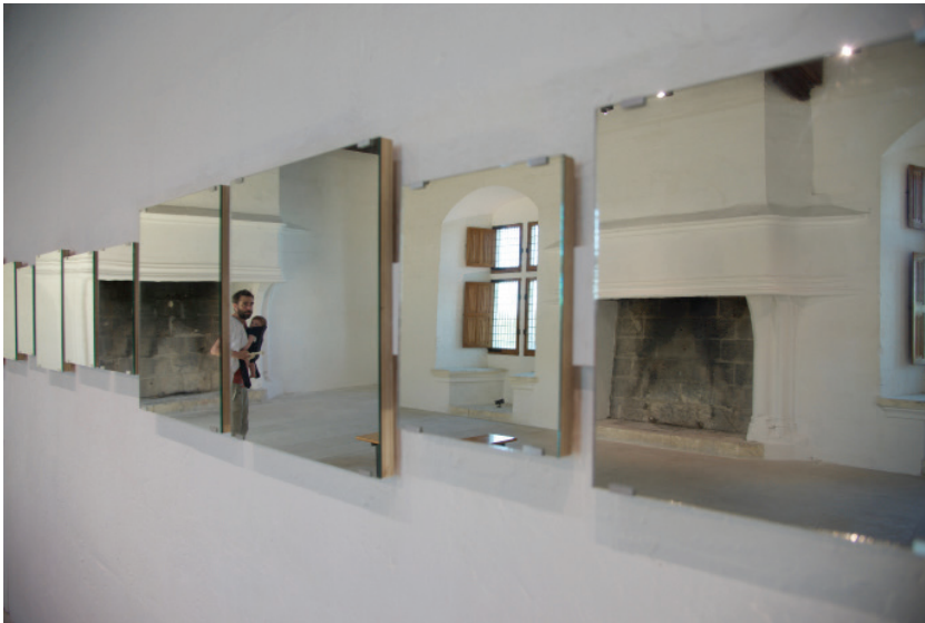
Mirror piece 1965

Mirror piece is a mural installation comprising a series of 20 mirrors of various sizes, on which distorting or regular glass has been attached. They are accompanied by a series of typewritten sheets of paper ideal for forming groups of mirrors according to size or reflection.