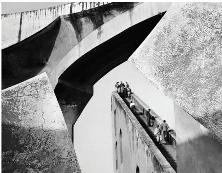
Lucien Hervé, Observatoire, Delhi, Inde, 1955

at the jeu de paume - château de tours : lucien hervé, 'the geometry of light', 18.11.2017 - 27.05.2018